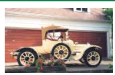
1912 Talbot CT12 '4 Cylinder

An interesting pre WW1 motor car that is capable of speeds in excess of 60mph! An ex-museum car that is owned & maintained by a local engineer/enthusiast and is in excellent condition. It comes with plenty of spares and more interestingly the registration J1910. £34,950.