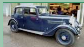
1936 Rover 14 Saloon

One of the three frogeyes that croaked and came to us for resuscitation during the last year. These cars needed sills, doors, floors, bonnets....in fact everything.