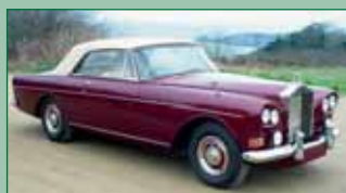
Rolls-Royce Silver Cloud III Convertible

Far from ideal for the school run we converted it into a custom built luxury day van. Totally stripped down with all corrosion cut away then refinished and trimmed with period retro fittings.