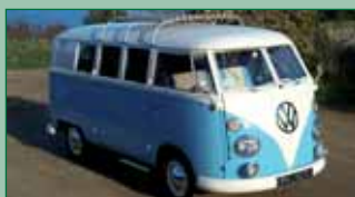
VW Split screen Ambulance

Amongst our busy restoration, servicing and maintenance schedule we have been entrusted with some interesting projects which can now be seen purring & roaring around our Island roads.