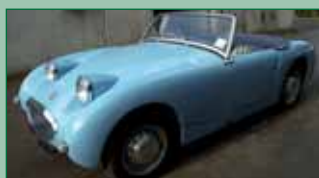
Austin Healey Frogeye Sprite

A time consuming process has seen this beautiful Mulliner bodied Rolls-Royce restored back to as good as new condition. Paint removal revealed extensive corrosion to the lower 6 inches requiring...well, loads of work!