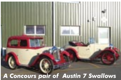
A Concours pair of Austin 7 Swallows

Considering the fun and financial rewards it's surprising there aren't even more classics in regular use on a daily basis!