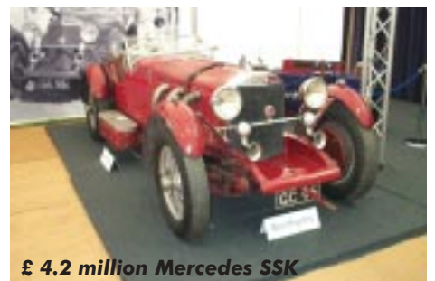
£ 4.2 million Mercedes SSK

This year the Goodwood Revival saw records broken not only on the track but also in the Auction Room. A crowded Bonhams Marquee saw a 1929 7.1 litre Mercedes SSK sports tourer sell for £4.2 million, setting a new record for the highest price ever paid for a motorcar in Europe. For those of us who don't appreciate patina ..... it needed restoring!